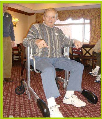
Seat brought to sitting position. Person can then stand up.