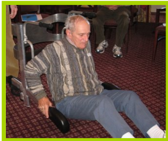
Seat lowers, person shuffles onto seat, and presses UP button.