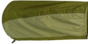
fully deployed JAKPAK™